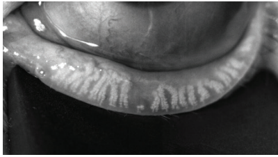
SHORTENED GLANDS & GLAND LOSS